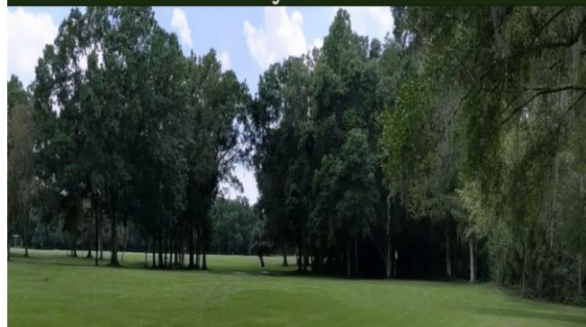
Florida's Light and Life Park