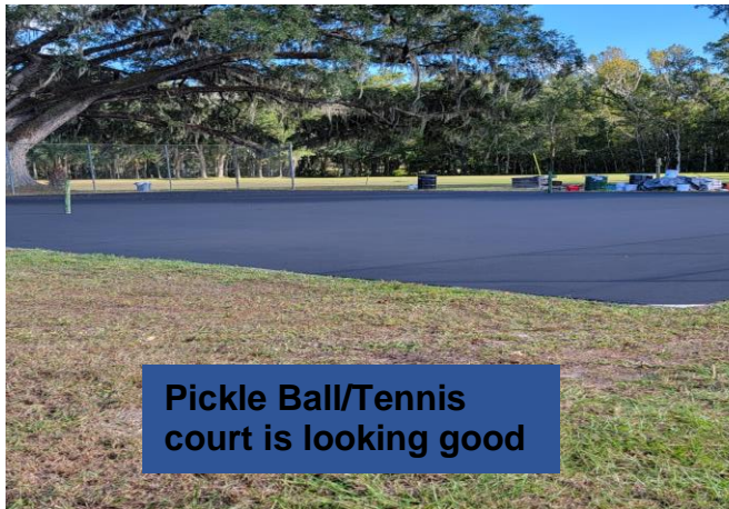
Pickle Ball/Tennis court is looking good