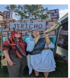
The Beautification Committee