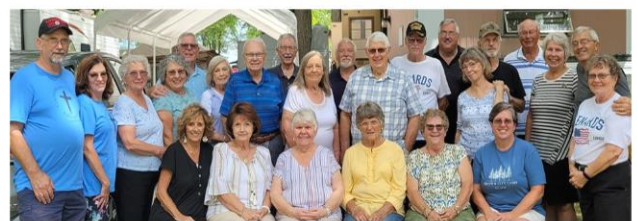
2024 Attendees Pictured

Bring a dish to pass and a couple $ for chicken.