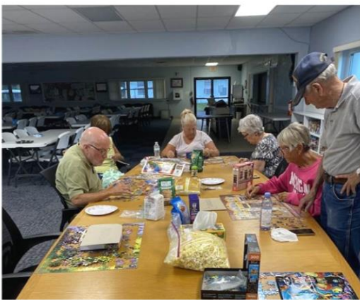
Puzzlers finally back at their table in Hood Hall