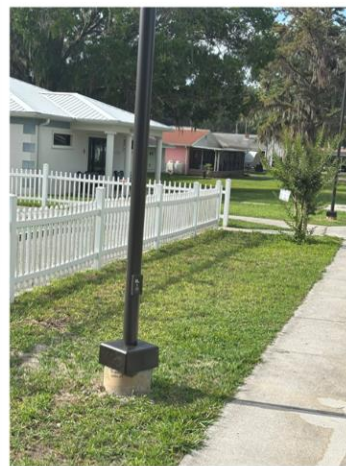
Light poles installed near the library to brighten the path at night