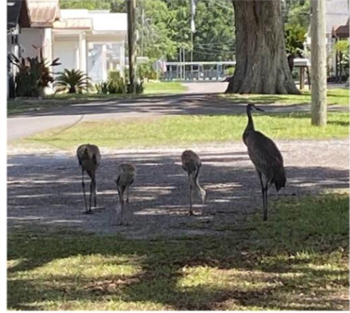
Fred and Ethel's twins are growing rapidly!