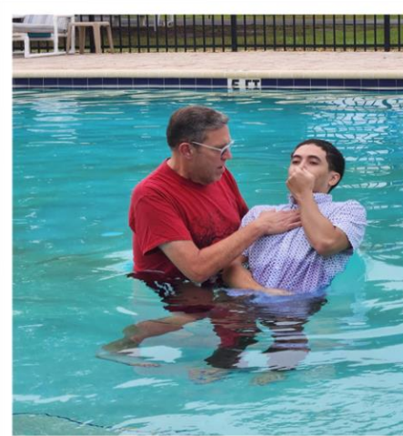
To God be the glory!!